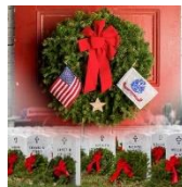
Sponsor A Wreath

https://www.facebook.com/profile.php?id=100079902524868 .