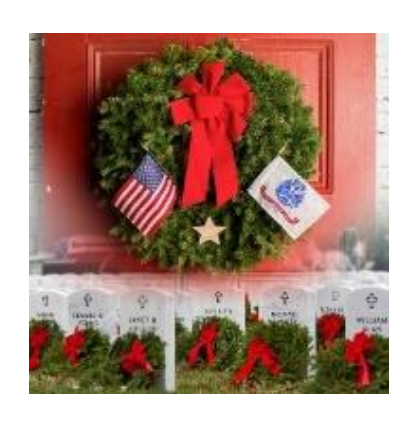
Sponsor A Wreath